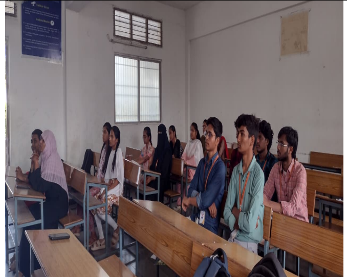
Fig: - Students Participated the Event