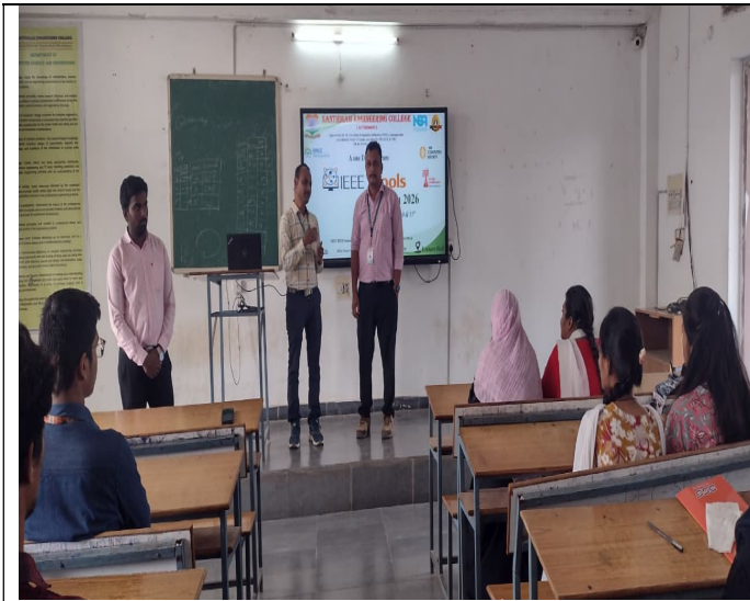
Fig: Branch Counsellor Speech About Event IEEE & Officer Reporting