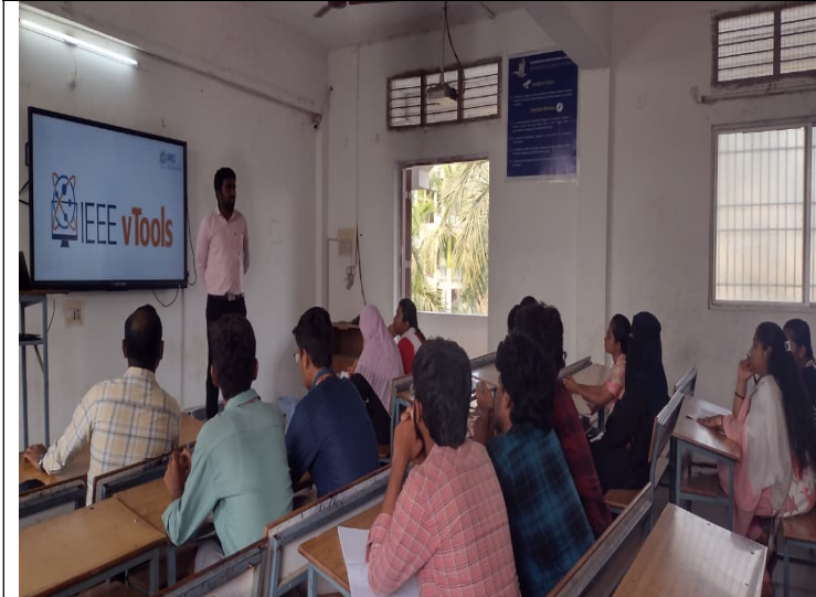
Fig: Presenting How to Manage V Tools IEEE & Process to File & Report the Event

Approved by AICTE: New Delhi, 2(f) & 12(B) recognition by UGC Act, 1956 Accredited by NAAC (Grade-A), Accredited by NBA (ECE & CSE) ISO 9001:2015 Certified Institution, Permanently Affiliated to JNT University, Ananthapuramu.NH-40, Nandyal - 518501, A. P. Web: www.srecnandyal.edu.in