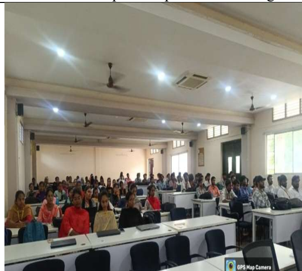
Photo: Participants of the Program